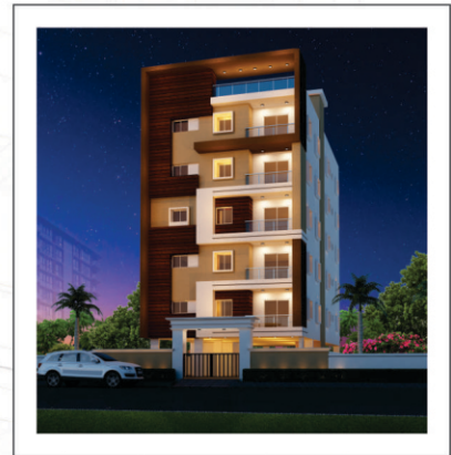
Aditi Balaji Elite @ Kondapur