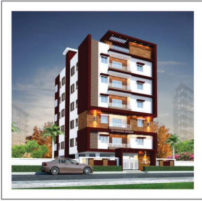
Sri Krishna Dhamam @ Kondapur