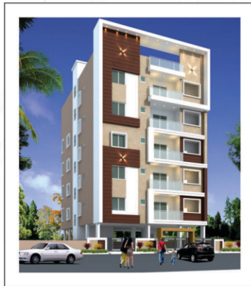
Aditi Shyamala Elite @ Madinaguda