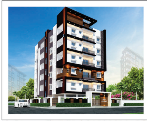
Aditi Annapurna Residency @ Kondapur