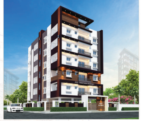
Aditi Annapurna Residency @ Kondapur.