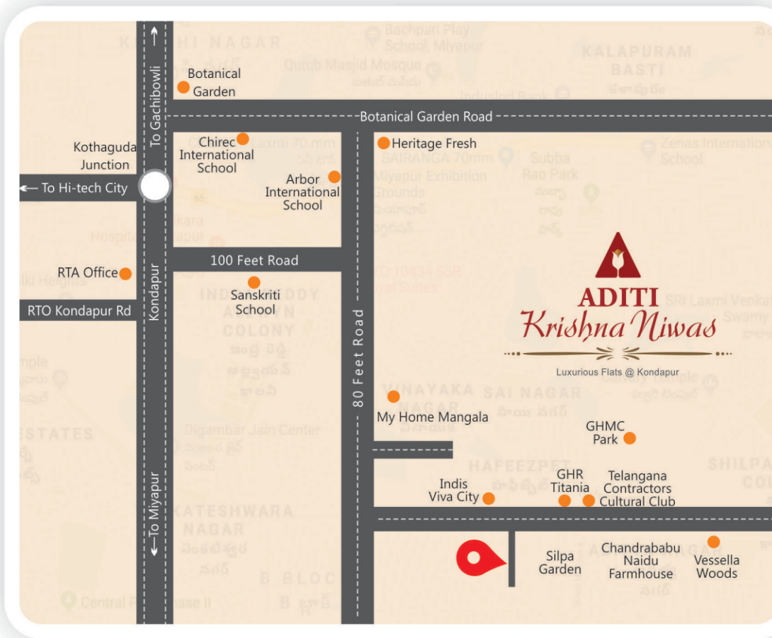
Location Map (not to scale)