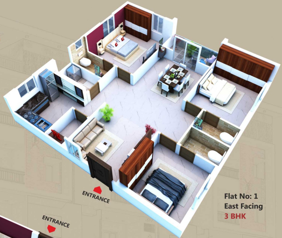
Flat No: 1 East Facing 3 BHK