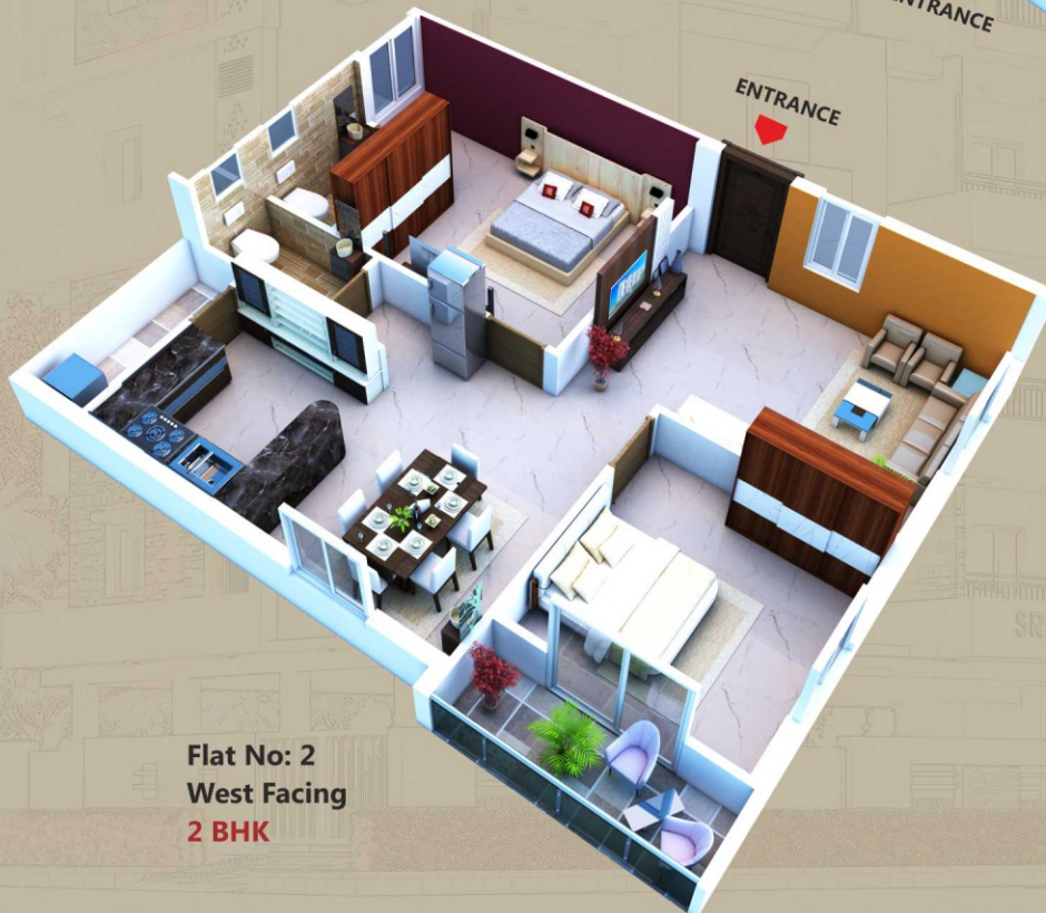
Flat No: 2 West Facing 2 BHK